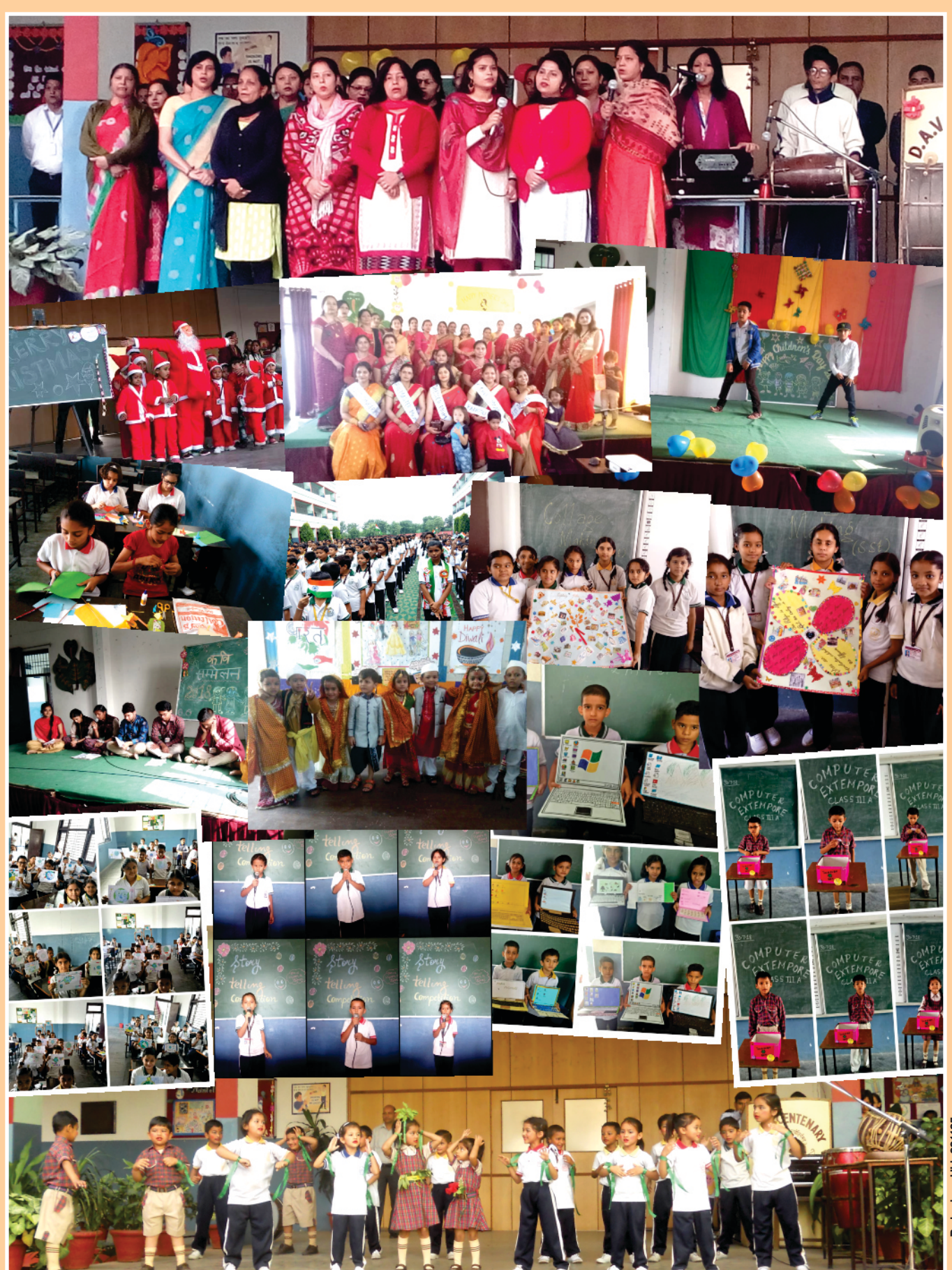
Uttarayan Prakashan, Hld.-221125